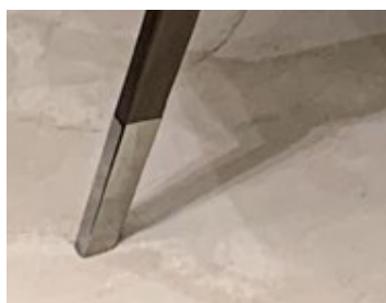
Chromed metal ferrule