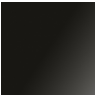
Ceramilux® gloss black