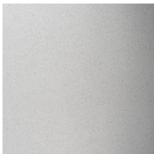
Reconstructed stone (X084)