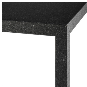
Black Ebony (X111)