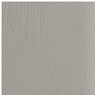
White Calce (X131)