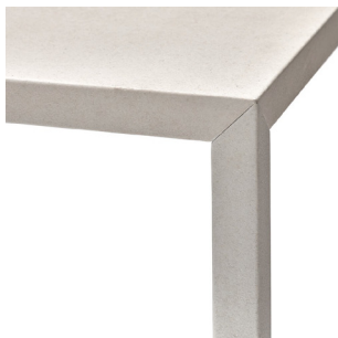
White Carrara (X120)