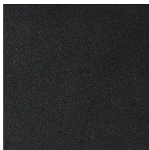
Goffered matt black iron painted (X130)