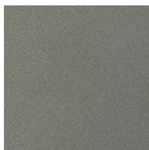
Goffered matt pewter painted (X129)