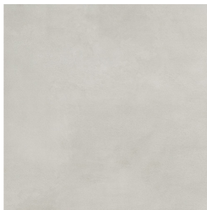
Light grey calce matt ceramic