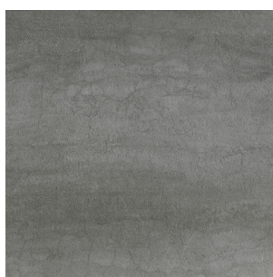
Matt medium grey Pietra di Savoia ceramic