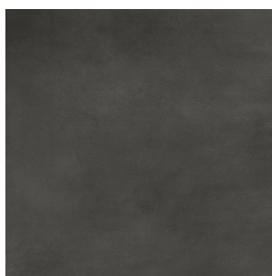
Black calce matt ceramic