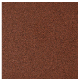
Goffered matt corten painted (X128)