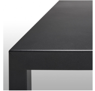
Black iron (X130)