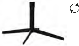
360° swivel with memory return

4-spoke column base in black lacquered steel Glides: PVC