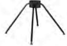
360° swivel with or without memory return - Invisible mechanism

4-spoke column base in black lacquered steel Glides: PVC