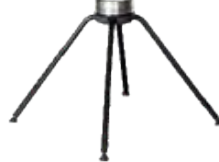
360° swivel with or without memory return - Original mechanism