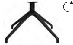
360° swivel without memory return

Black lacquered die cast aluminum Glides: PVC