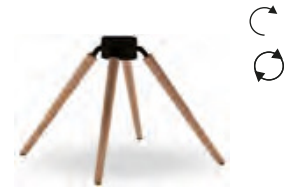
360° swivel with or without memory return - Invisible mechanism

Solid oak or canaletto walnut round section legs