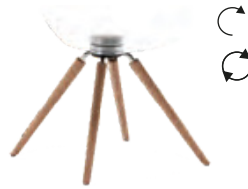
360° swivel with or without memory return - Original mechanism