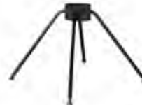
360° swivel with or without memory return - Invisible mechanism

Die cast aluminum base lacquered in black, dark grey or mud color Glides: PVC