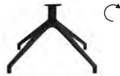
360° swivel without memory return

Die cast aluminum base lacquered in black, dark grey or mud color Glides: PVC