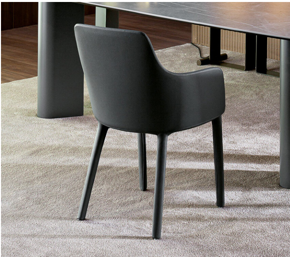
Metal legs visible