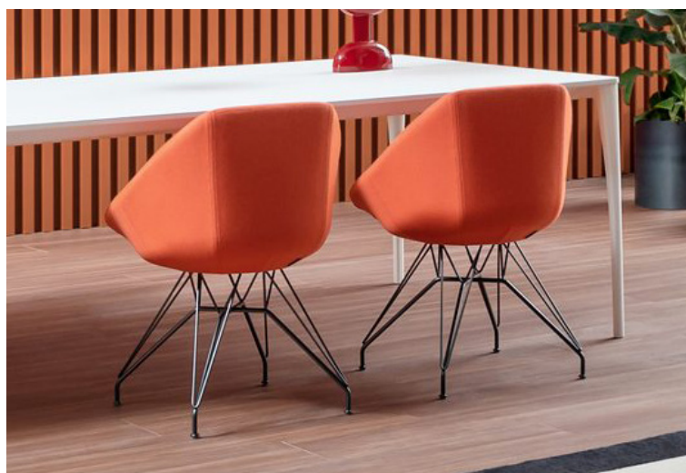
Base with metal rods