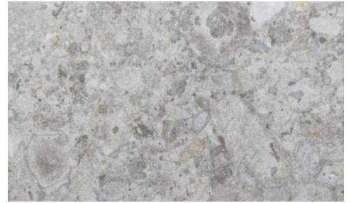
CD - CEPPO DOLOMITICA