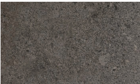
TM - TERRA MARRONE