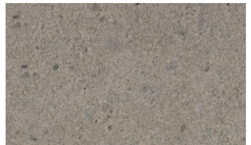
TS - TERRA SABBIA