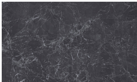
NM - NERO MARQUINA