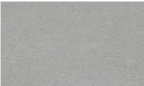
CL - CEMENTO LUMINOSO