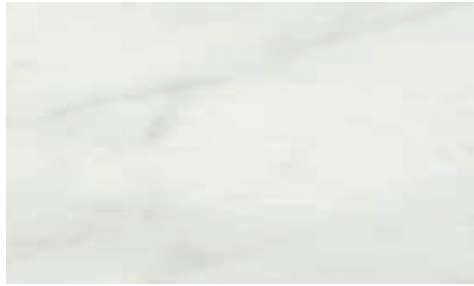
BS - BIANCO STATUARI