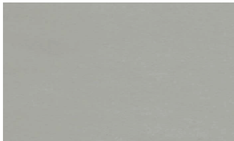
PG - PEARL GREY