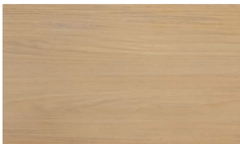
W - TEAK