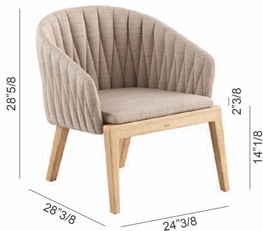
VERSION 1: Padded and upholstered backrest