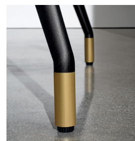
Optional brass lacquered feet on embossed black legs

Base & Legs: Aluminum (Embossed White / Black / Clay / Mocha / Burnished metal).