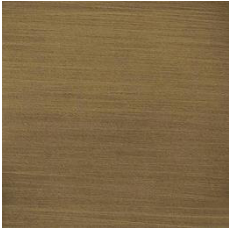
Antique bronze satin