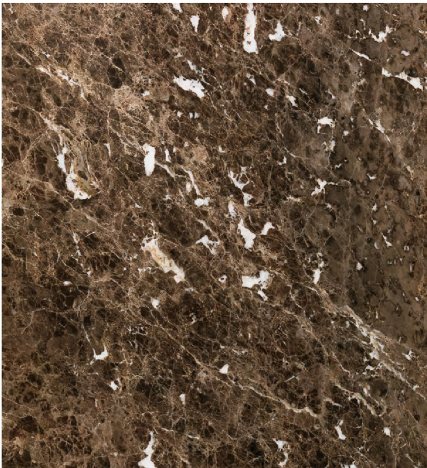
EXAMPLE OF GRAIN AND COLOR