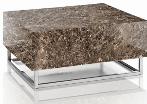
Marble structure: 3/4" thick

Coffee table with stainless steel base and structure available in a wide range of marble options. Made in Italy.