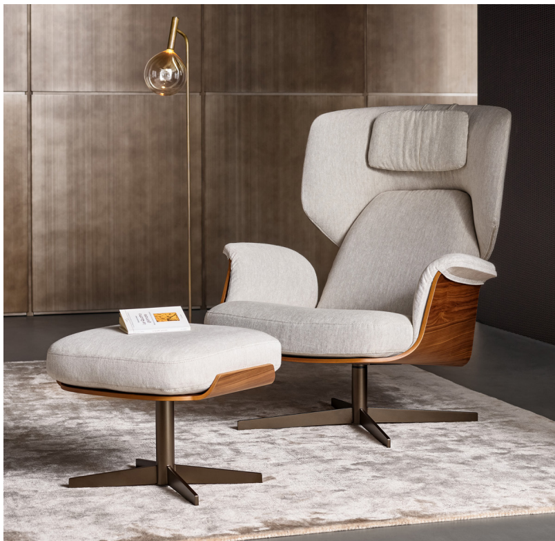
Lounge Chair (non-removable cover)