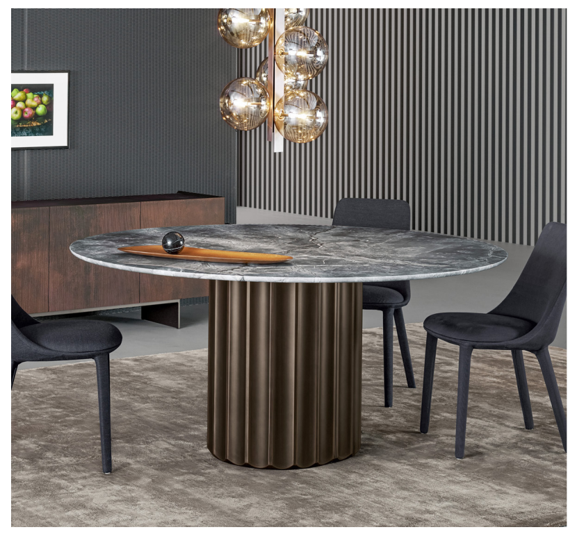
Top thickness: Wood: 1"1/8 | Ceramic: 5/8" | Marble: 3/4"