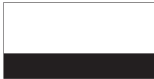
White, black edge