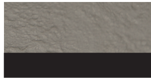
Rough Quarz, black edge