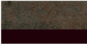
Corten, brown edge