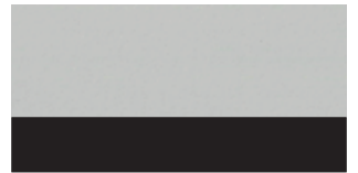
Silk Grey, black edge