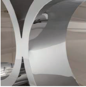
Shinig stainless steel