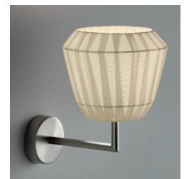
— wall lamp without switch detail.