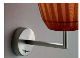
— wall lamp with switch detail.

► Special version acoustic comfort available on demand.