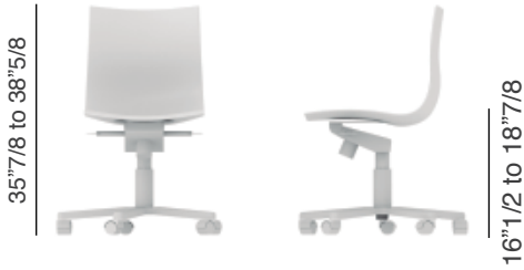
Blade Conference Chair BEVERLUFFCUOI: 18"1/8W x 22"1/4D x 34"5/8 to 38"5/8H

Conference armchair with swivel, tilt and gas-lift mechanism. Cover in saddle leather. Seat height: 18"1/8 to 22".