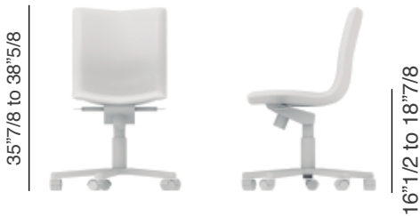
Blade Conference Chair BEVERLUFFIMBO: 18"1/8W x 22"1/4D x 34"5/8 to 38"5/8H

Conference armchair with swivel, tilt and gas-lift mechanism. Seat height: 18"1/8 to 22".