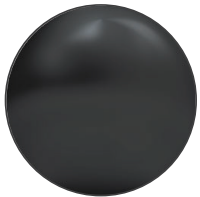
Matt Black 9005