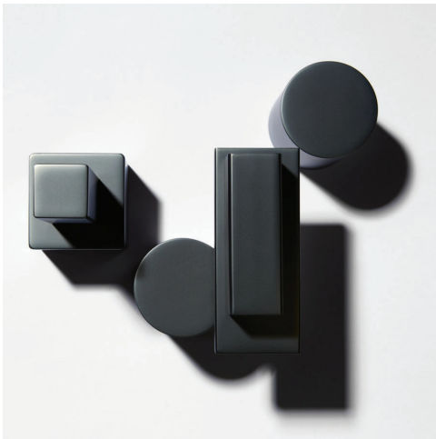
Matt black nickel