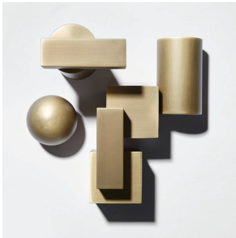
Light burnished brass