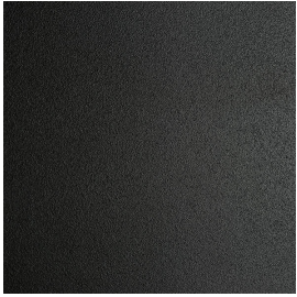
Graphite Embossed Lacquered Steel (GFM69)