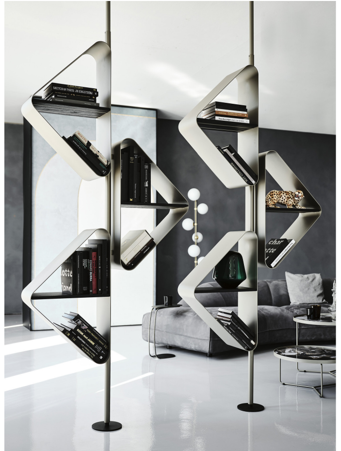
The image corresponds to the Y Ceiling / floor fixed model