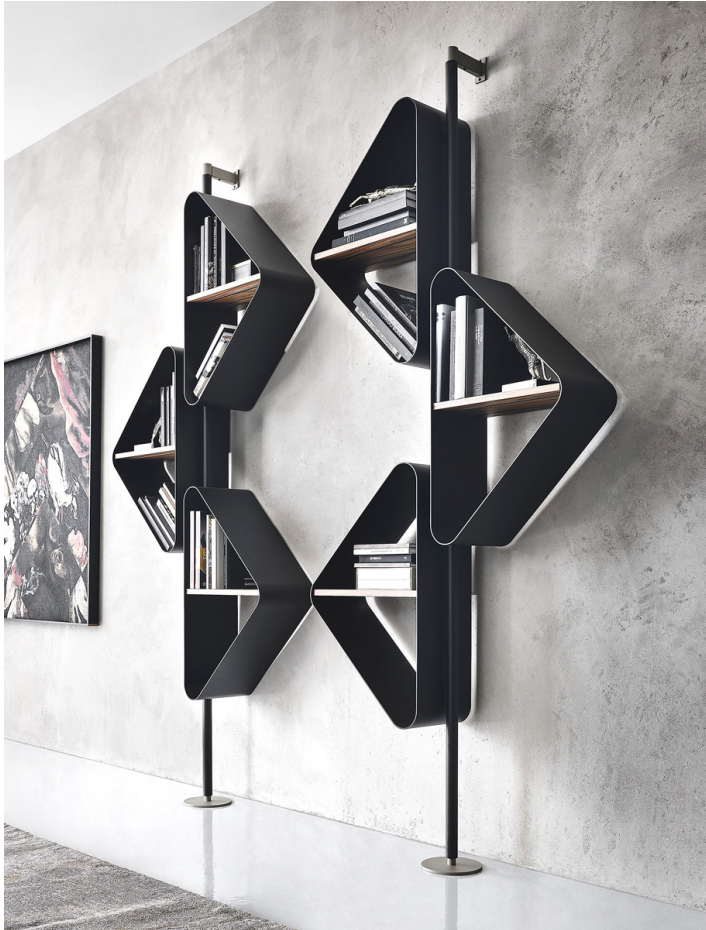
The image corresponds to the X Wall-fixed model