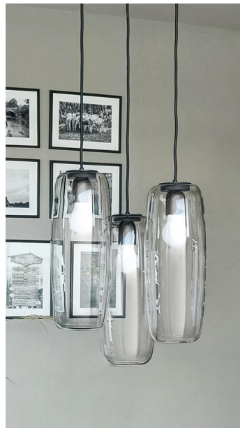
With 1 pendant