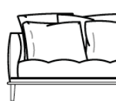
Perimeter base with metal profile