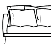
Perimeter base without metal profile