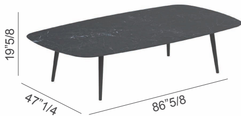
A: Oval Table A