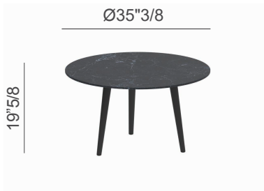
E: Round Table A