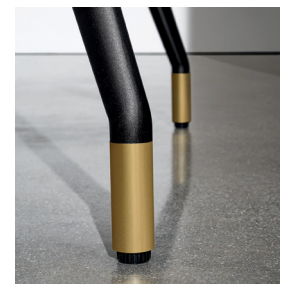
Optional brass lacquered feet on embossed black legs