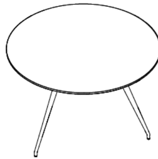
With wood, matt lacquered, glossy marble effect or ceramic top