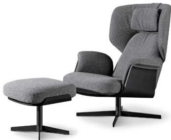
Lounge Chair (non-removable cover)