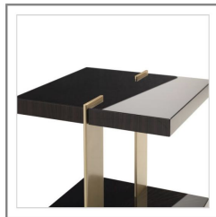
Detail view: Inlaid top with aluminum structure panels in Gold finish.