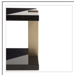
Frontal view: Top & base in optional Glossy Ebony finish.