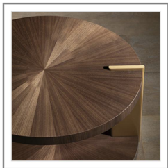
Detail view: Inlaid round top in Dark Stained Walnut finish.