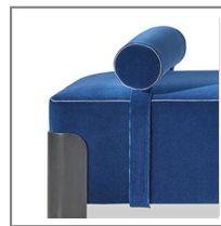
Detail view: Optional roll cushion.