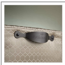
Detail view: Optional brass handle for rear backrest with engraved Bellavista logo.