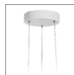
Canopy Ø6”1/4 x 1”1/4H