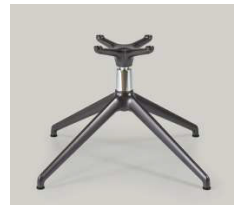
4 point star swivel base