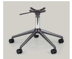
5 point star swivel base