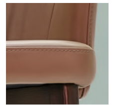
Thread tone on tone