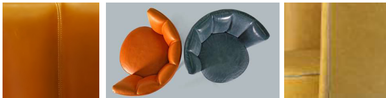
Saddled double stitching