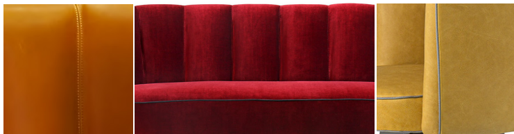
Saddled cross stitching