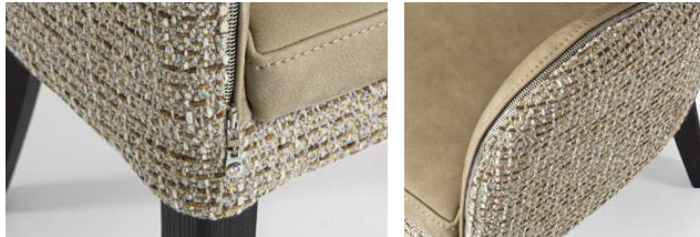
Metal zip with strass pendant