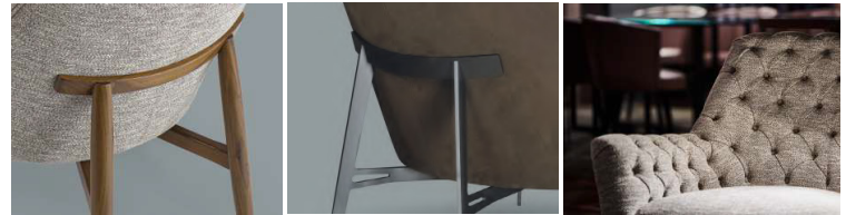
Wooden or metal base