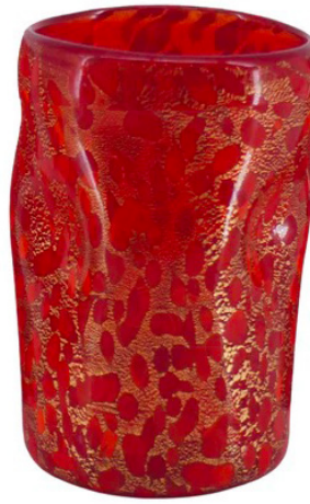
Red & Gold