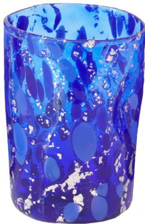
Blue & Silver