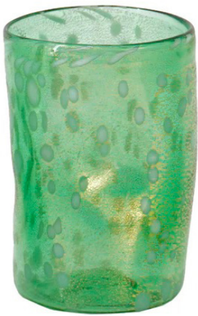
Green & Gold