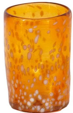
Topaz & Gold