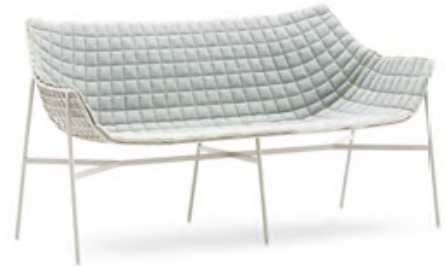
With standard cushion