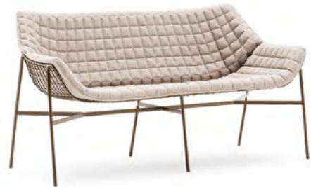
With comfort cushion